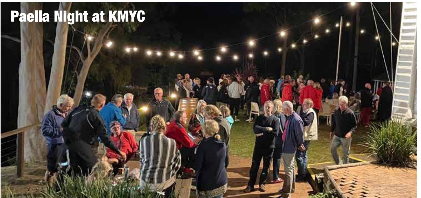
Paella Night at KMYC