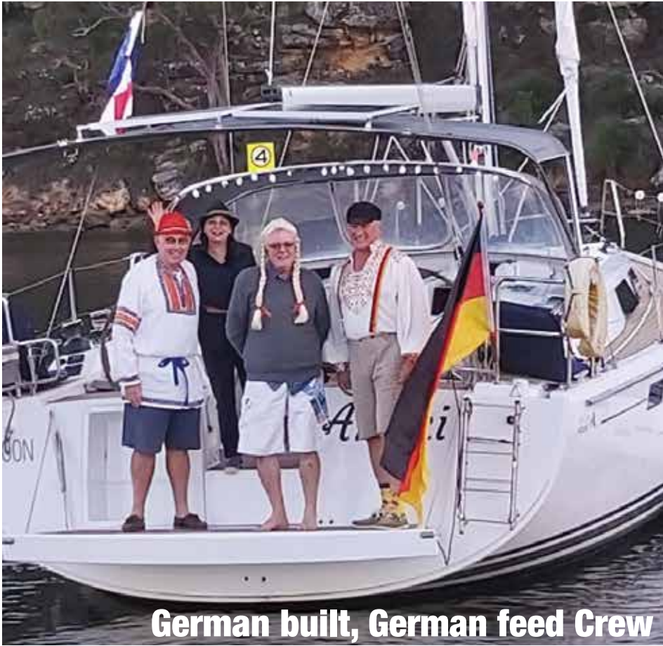
German built, German feed Crew