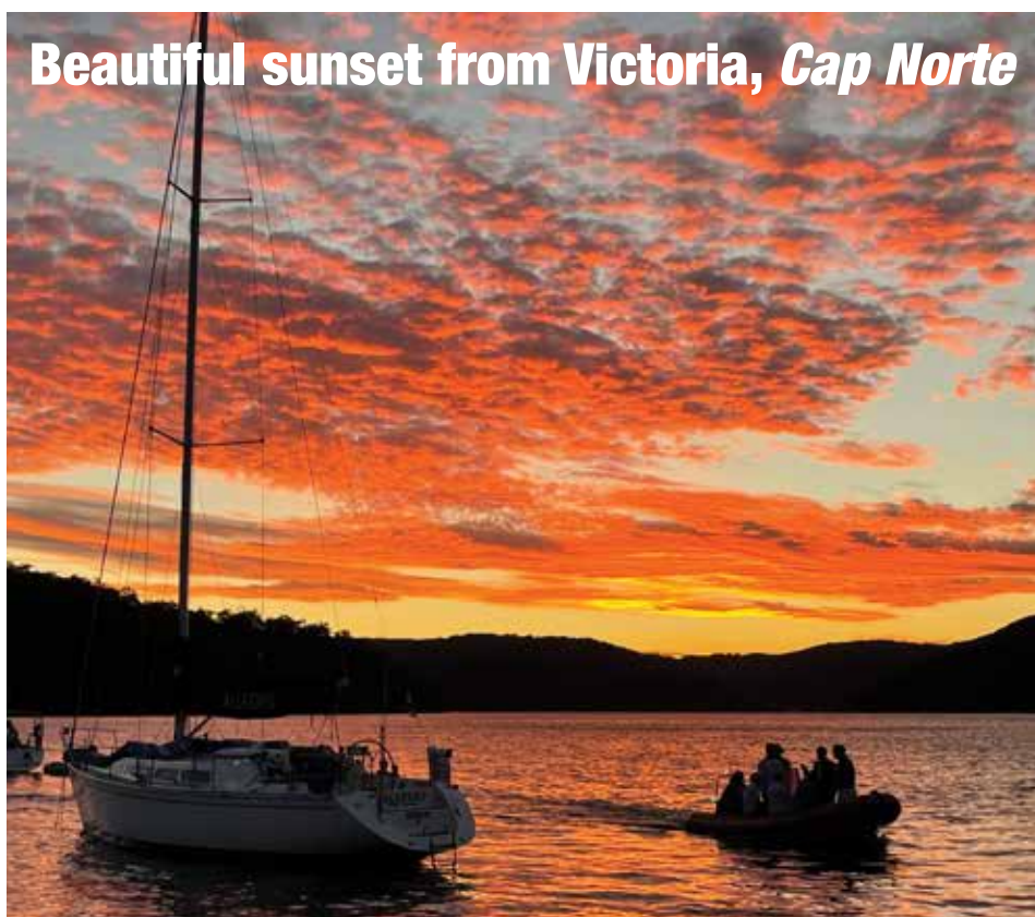
Beautiful sunset from Victoria, Cap Norte