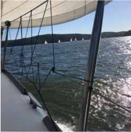
Lovely to see Southern Cross back out