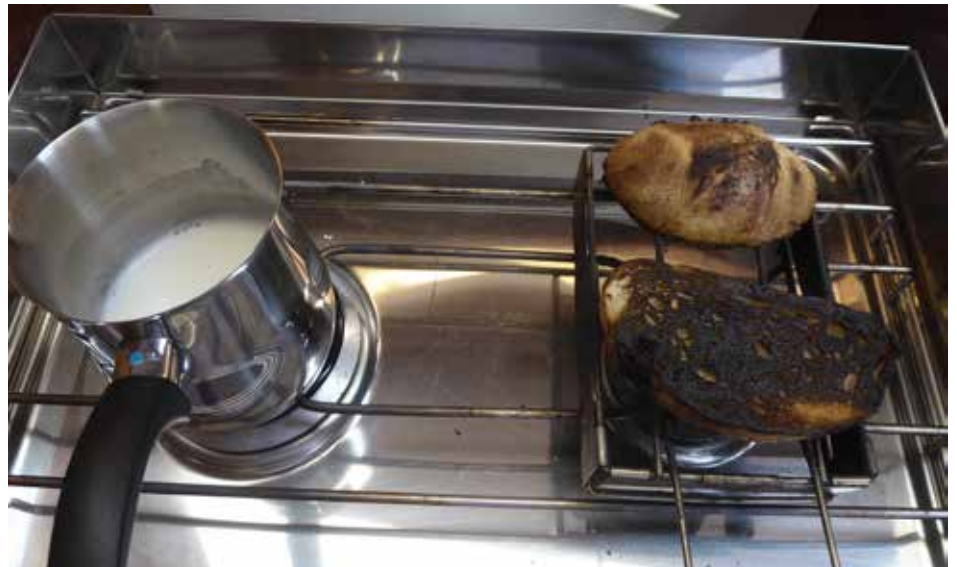
Breakfast of champions after 'First night fever' - ooops, one for the fish I think. Apologies to nearby boats for all the smoke.