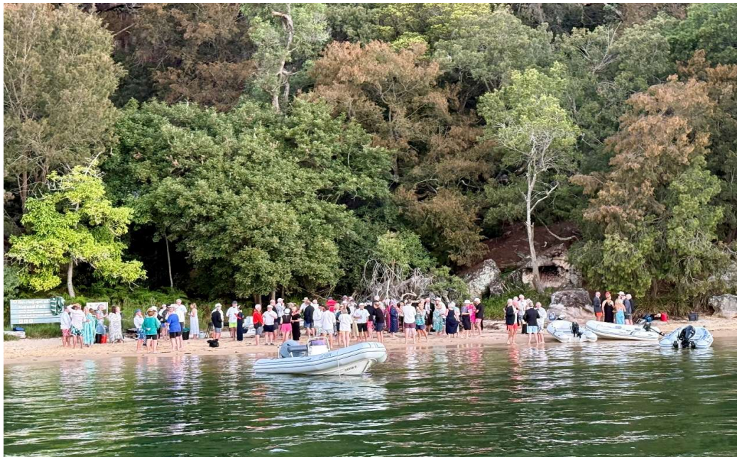
Halletts