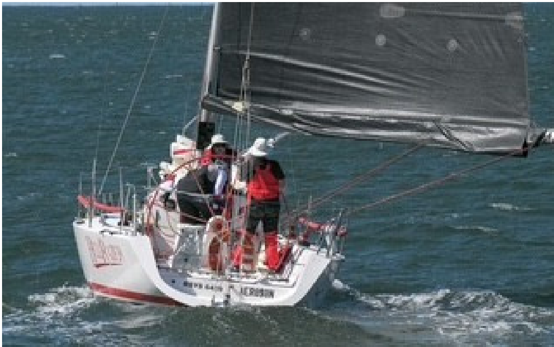
Following Hell Razer