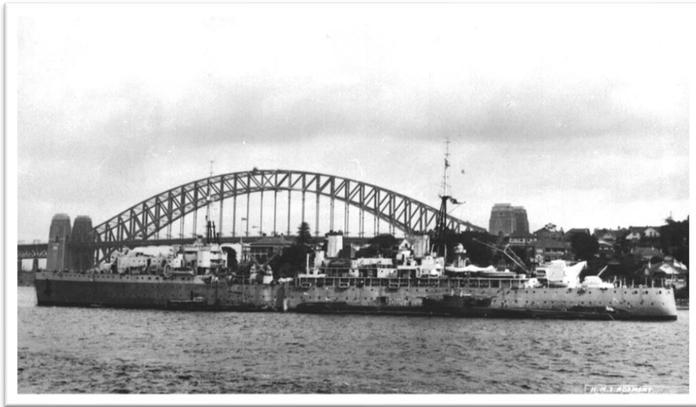
HMS Adamant at the Kirribilli dolphins in 1946 with a T-class submarine alongside

The role of HMAS Adelaide at her berth off the Squadron was that of a base and accommodation ship for submarines of British Pacific Fleet in Sydney. British submarines were supported in Australia by three Royal Navy Depot ships, HMS Maidstone , HMS Adamant and HMS Bonaventure . The submarines alongside HMAS Adelaide in the photograph belonged to the Royal Navy's 4 th Submarine Flotilla. HMS Adamant was responsible for that Flotilla from October 1943, at first based in Colombo and Trincomalee. In April 1945 Adamant moved to Fremantle and in October that year to Hong Kong. She arrived in Sydney on 3 April 1946 and was secured for a time at the Kirribilli dolphins, around the corner from the Squadron near Admiralty House. A destroyer depot ship, HMS Tyne , had also been located there for a time during 1945. Adamant left Sydney for the last time on 5 July 1946.