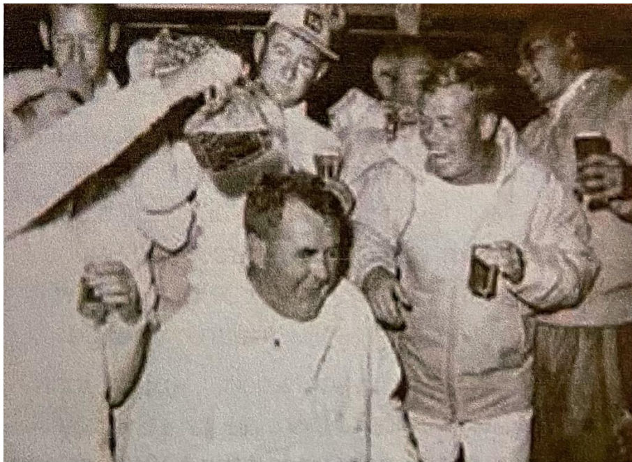
The crew of Greتل celebrating