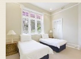
2/24 Peel double room