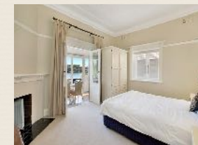
Rooms uniquely furnished with memorabilia