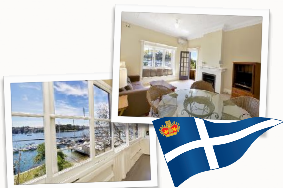
Relaxed waterfront accommodation on Sydney Harbour

Recently renovated, fully self-contained apartments with air-conditioning, TV, fully equipped kitchen, most with laundry facilities, all with views to Careening Cove and Sydney Harbour. Rooms are serviced twice weekly or as requested. Apartment guests are welcome and encouraged to use the Club. We can also cater for your food and beverage requirements during your stay.