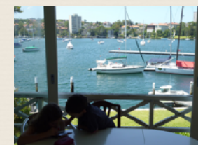
View from Top Elamang