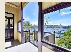
Balcony 2/24 Peel