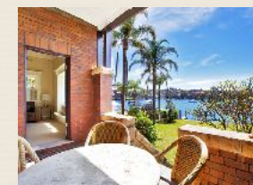
View from Bottom Elamang balcony