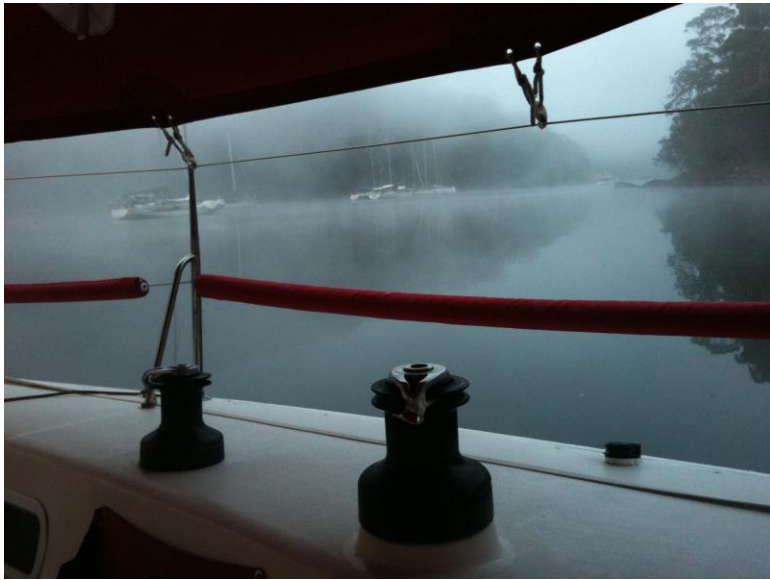
Broken Bay with our fellow participants.