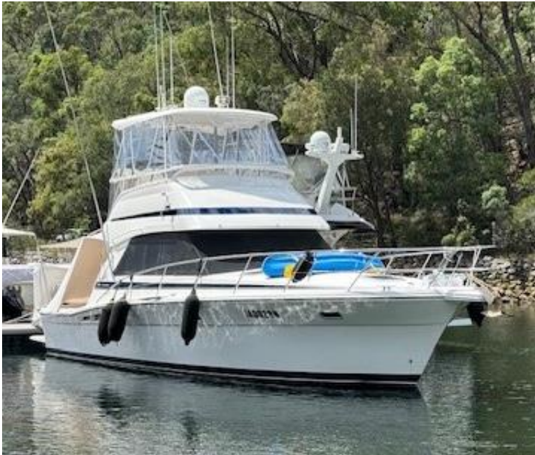
friends in Smiths Creek enjoying the water and partying on.

Party On is a Riviera twin cabin flybridge cruiser berthed at Akuna Bay and calls Cowan Creek and Pittwater home.