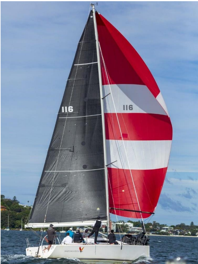
Sydney Harbour Keelboat series.

Whistling Kite is a 2007 Seaquest RP 36 and is one of 5 known Seaquest RP 36's brought into Australia in the late 2000's. Seaquest was originally a UK based shipbuilder and moved its operations to Dubai in the mid 2000's. Based on the Seaquest SQ36 launched by Seaquest Yachts in 2000, Reichel-Pugh was engaged to enhance the design which led to the Seaquest RP (for Reichel-Pugh) 36.