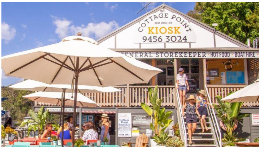
OPEN 7 DAYS • BREAKFAST & LUNCH • 8am – 4pm