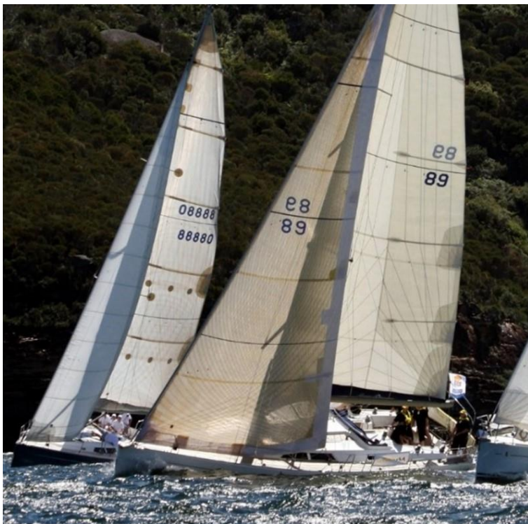
everyone on the water and the beach this year. Fair winds