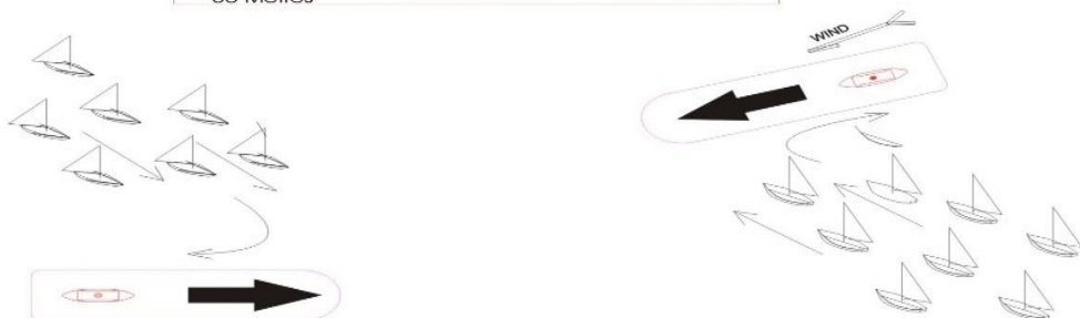
SHIP & FERRY ACTIVATED EXCLUSION ZONE