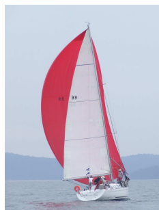
Siena III - Cruise 2007

Official Dinner Function 6.30 for 7pm Top Deck Dining Room